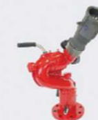
Monitor Jet / Fog Spray Flow rate 1200/ 1800/ 2400 LPM Working Pressure 14 bar In 2,5" | Out 2,5"