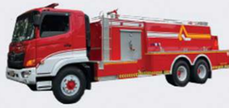
FT 10000 ltr Portable / PTO pump Single / Double Cabin