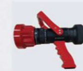
Selectable Nozzle 1,5" | 115-475 LPM @ 7 Bar 2,5" | 360-950 LPM @ 7 Bar