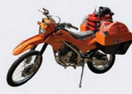
Trail Karhutla Fire Rescue Motorbike 2 HP Pump