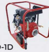
23HPVGD-1D High Volume 380000 Vanguard (Electric & Recoil) Flow 2080 LPM | Pressure 8 bar 1700 LPM @2 bar | 600 LPM @7 bar In 4" | Out 2,5"