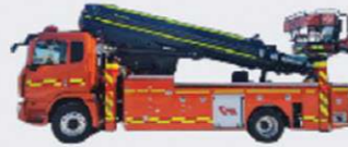
Aerial Ladder 21-52 meter