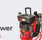
Foam Blower Knapsack Pump Engine power 6 HP Max flow 180 LPM | Pressure 4-12 bar Foam tank volume 8 ltr