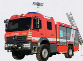
Truck Rescue Fire Truck with ladder