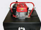
13HP-FL Floating Pump GXV390 Honda (Recoil) Flow 1700 LPM | Pressure 5,2 bar 1700 LPM @1,4 bar | 440 LPM @4,5 bar Out 2,5"