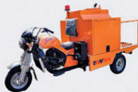
3 Wheel Fire Rescue Portable Tank 500 ltr