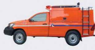
Single Cabin 600 ltr Portable mid range pump