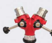
Y Connection Aluminum Alloy Casting Working Pressure 14 bar Brass ball valve with lock handle In 1,5"/ 2,5" | Out 2 x 1,5"/ 2 x 2,5"