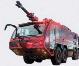
Airport Support Airport Support Fire Truck