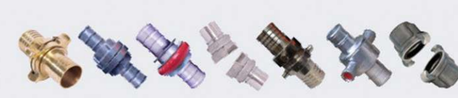
Coupling Material brass / aluminum alloy - 1,5" / 2,5"