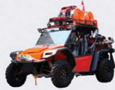
Forestry Fire Rescue Off-road firefighting