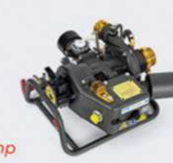
10 HP Backpack Pump Electric & Recoil Max flow 270 LPM | Pressure 18 bar Rated 180 LPM @7 bar In 2" | Out 1,5"