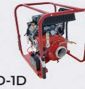
18HPVGD-1D High Volume 3564 Vanguard (Electric & Recoil) Flow 1480 LPM | Pressure 9 bar 1480 LPM @2 bar | 170 LPM @9 bar In 4" | Out 2,5"