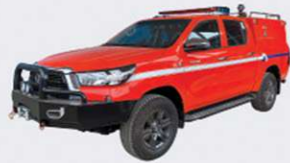
Double Cabin 400 ltr Portable mid range pump