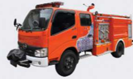
FT 3500 ltr Portable / PTO pump Double Cabin