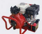
6HPHND-EM-TW High Pressure GX200 Honda (Electric & Recoil) Flow 284 LPM | Pressure 9,7 bar 270 LPM @0,7 bar | 130 LPM @9 bar In 1,5" | Out 1 x 1,5", 2 x 1"