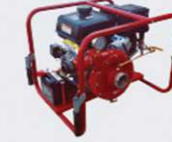
14HPKHL-EM-MR Mid Range CH440 Kohler (Electric & Recoil) Flow 910 LPM | Pressure 10 bar 780 LPM @2 bar | 440 LPM @7 bar In 2,5" | Out 1,5"