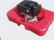
6HP-FL Floating Pump FJ180V Kawasaki Flow 760 LPM | Pressure 3 bar 760 LPM @0,3 bar | 190 LPM @2 bar Out 2,5"