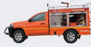
Jeep Rescue Light rescue Equipment