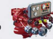
CN-10-300 PTO Pump Flow 3000 LPM Pressure 10 - 54 bar Normal/ Multi Pressure In 4" | Out 3"