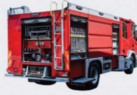
CAFS Truck Compressed Air Foam System