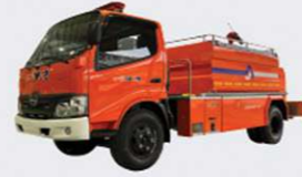
FT 4000 ltr Portable / PTO pump Single cabin