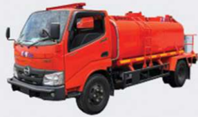
WS 4000 ltr Portable pump