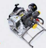
8 HP Backpack Pump Electric & Recoil Max flow 330 LPM | Pressure 16 bar Rated 198 LPM @7 bar In 2" | Out 1,5"